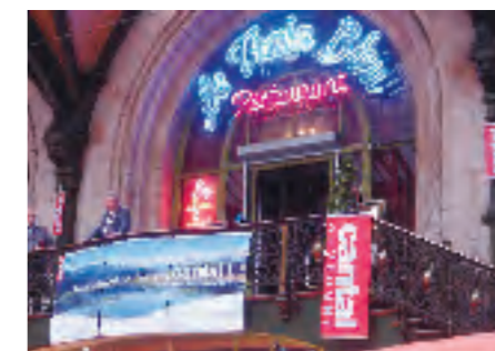
Cantal Auvergne took over the streets of Paris from October 22nd to October 28th, 2006